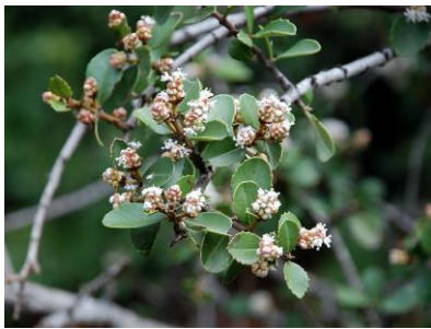
Endangered coyote ceonothus

The combined Tilton-Baird properties support thirteen natural land cover types, including habitat for five animal species and six California endemic plant species targeted for conservation by the Santa Clara Valley Habitat Agency. These include the endangered Bay checkerspot butterfly, threatened California red-legged frog, endangered foothill yellow-legged frog, threatened California tiger salamander, western pond turtle, threatened tricolored blackbird, western burrowing owl, fragrant fritillary, Loma Prieta hoita, most beautiful jewelflower, Mount Hamilton thistle and smooth lessingia.