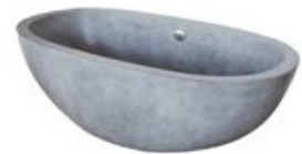
NATIVE TRAILS: Avalon 62 NativeStone Freestanding Soaking Tub in Ash