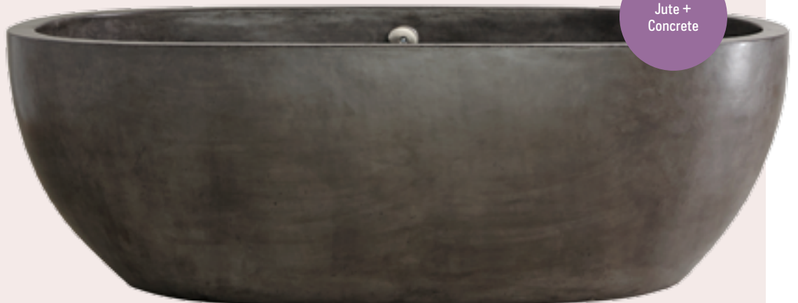
Jute + Concrete

↑↑ Masquerading as Carrara Statuario marble, this elegant basin by Cielo is actually made from ceramic, and is a mere 5 millimetres thick. From $2,080, ceramicacielo.it