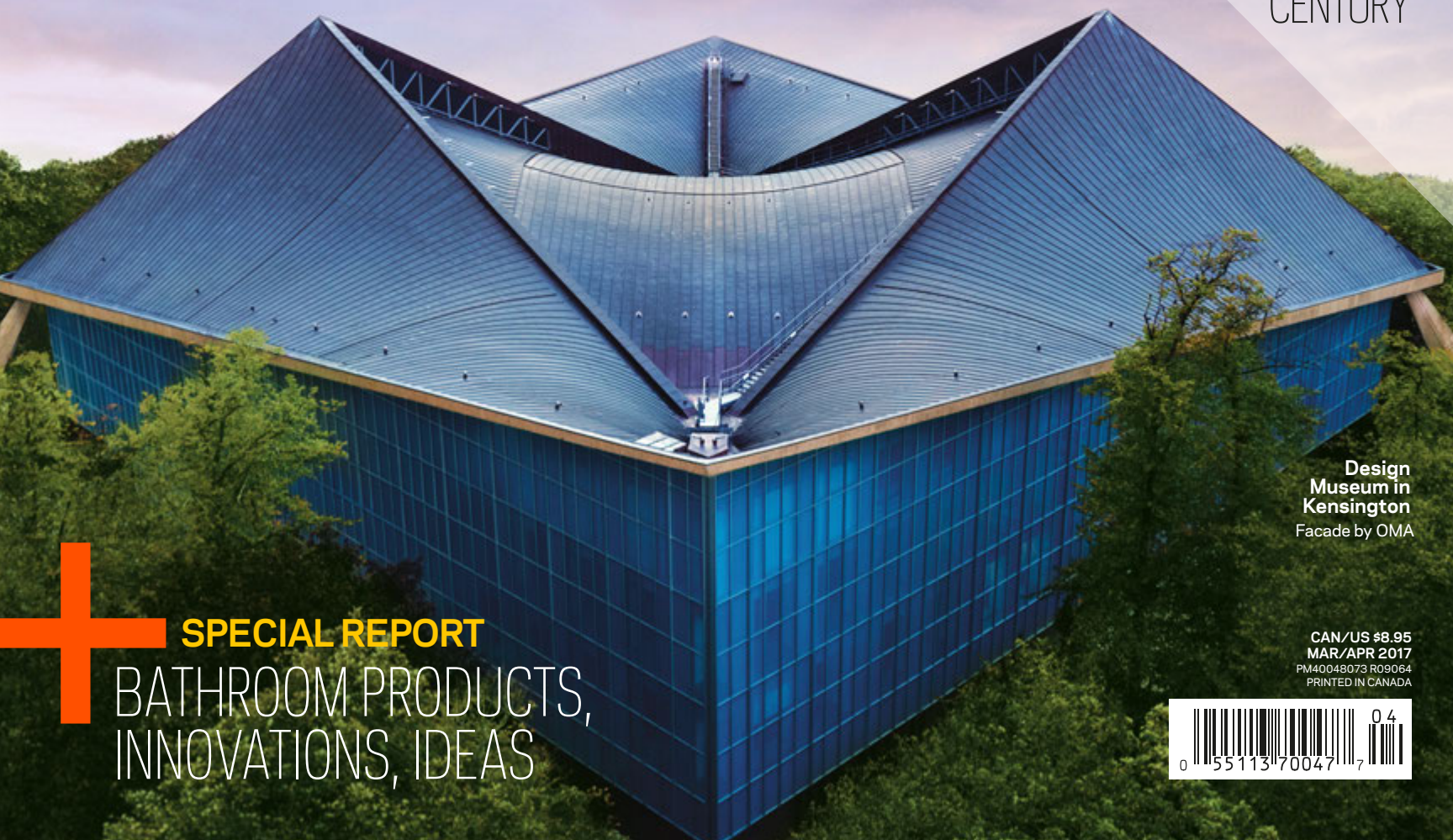
Design Museum in Kensington Facade by OMA

5 CULTURAL PALACES THAT DEFINE THE 21ST CENTURY