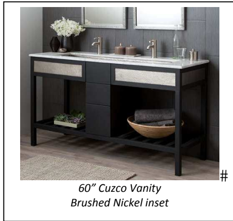
60" Cuzco Vanity Brushed Nickel inset