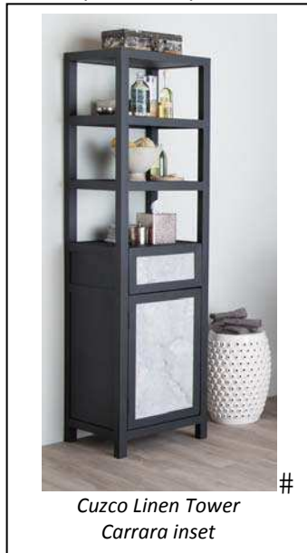
Cuzco Linen Tower Carrara inset