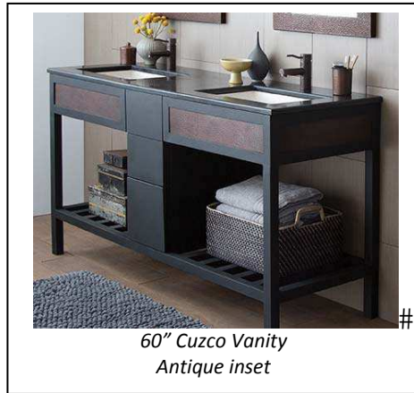
60" Cuzco Vanity Antique inset