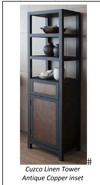
Cuzco Linen Tower Antique Copper inset