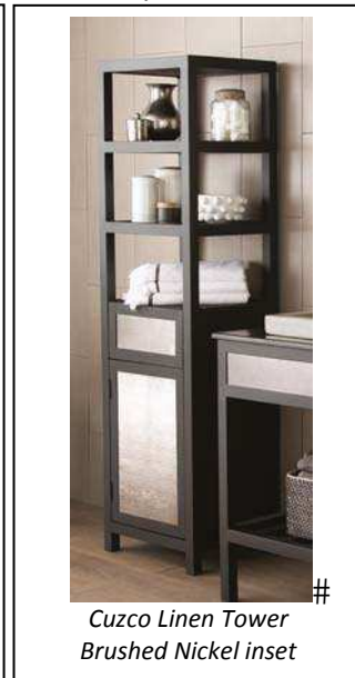
Cuzco Linen Tower Brushed Nickel inset