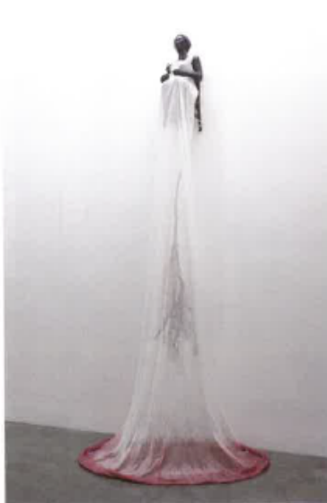
"UNDONE," 2012, Alison Saar FIBERGLASS, COTTON DRESS, FOUND CHAIR AND OBJECTS