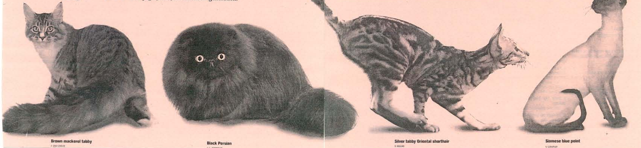
Brown mackerel tabby