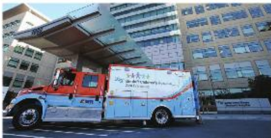
Ambulances this weekend will be transporting patients from UC San Francisco's Parnassus and Mount Zion campuses to three new UCSF hospitals in Mission Bay.

fer from Parnassus to the women's and children's hospitals will include 137 children and women, some who are pregnant or have just delivered a baby. And 12 patients will move from Mount Zion to the new cancer hospital.