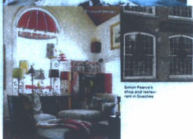
Simon Pearce's shop and restaurant in Quechee