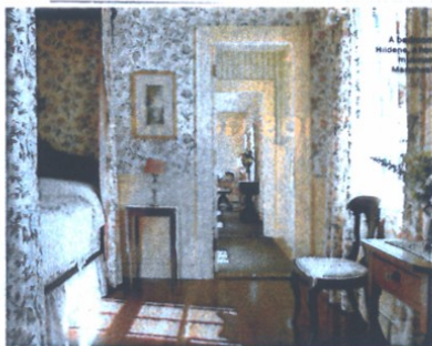
A bedroom at the Robert Frost Stone House Museum