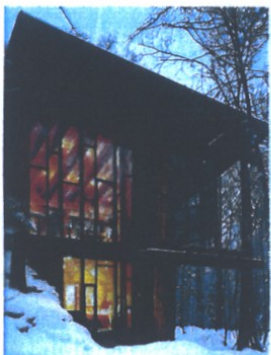
Aviary, a cottage at Twin Farms resort

Pick historic Route 7A and venture north, stopping in South Shaftsbury at the Robert Frost Stone House Museum, where the writer composed many poems included in his 1923 Pulitzer prize-winning collection New Hampshire . (Frost moved to Vermont from New Hampshire in 1920 and spent the next 40 years farming here.) In nearby Arlington is the Norman Rockwell Exhibition, where some 500 of the artist's illustrations, prints, and covers for Text (continues on page 104) D-