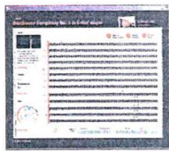
A page at www.keeping_score.org helps users explore the musical notation of Beethoven's "Eroica" Symphony No. 3 in E-flat major.

"It came out of the notion of taking that further, of using the media in