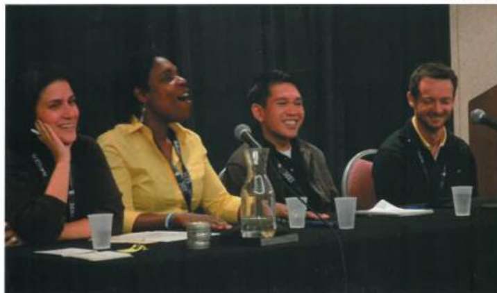
Workshop participants at last year's Out & Equal Workplace Summit

More than 3,000 attendees are slated to participate in dozens of workshops and caucuses at this year's conference, which takes place in the organization's home city – and the hub for LGBT rights and advocacy. In addition to LGBT activists, allies and community leaders including Billie Jean King and Olympia Dukakis who will be speaking, new findings from the annual Workplace