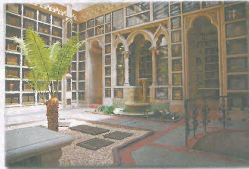
The Julia Morgan Mausoleum

Hearst Castle, the bay area resident designed more than 700 buildings including Chapel of the Chimes in Oakland. This year, Chapel of the Chimes is adding 160 new cremation niches in honor of the 85th an-