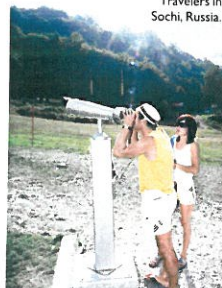
Travelers in Sochi, Russia.

hotels.com; doubles, $95-$125). Culture vultures head to Chettinad, in Tamil Nadu, where mansions are being converted into boutique hotels— Visalam is a favorite (91-484-301-1711; cgheart.com; doubles, $117). And by 2020, 20 million Indians are expected to go overseas to places like New York and the Pyramids. China Hainan Island is finally living up to the Hawaii hype, with Banyan Tree Sanya , its latest high-end resort (86-898-8860-9988; banyantree.com; doubles, $100). The new-money set are discovering cruising, particularly around Malaysia and Brunei, as liners like Silversea expand Far Eastern trips (silversea.com; nine-night cruises from $5,311 per person). And country pads are now de rigueur for the super-wealthy: 100 international architects are designing villas and public buildings in the city of Ordos, Inner Mongolia.