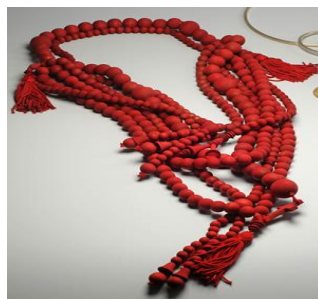
'Bound by Blood' (2007), Katja Prins, wood