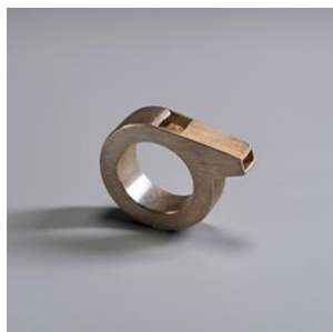
'Triller Ring' (1995), Hannes Wettstein, silver

WHAT: More than 70 pieces of jewelry created by 51 internationally-renowned designers offer an imaginative, thought-provoking and sometimes humorous vision of contemporary jewelry at the United States debut of Designers on Jewelry: 12 Years of Jewelry Production by Chi ha paura...? , presented by the San Francisco Museum of Craft+Design , January 15 – May 16, 2010. The exhibition features pieces produced by Chi ha Paura? Foundation , as well as limited production forms and unique prototypes, designed by some of the world's most eminent industrial designers from Europe, Taiwan, New Zealand and elsewhere. Launched in 1996 by jewelry and product designer Gijs Bakker, the Chi ha paura...? Foundation encourages respected artists working in all fields of contemporary design to create bold and inventive jewelry – with the ultimate goal of making intelligently-designed jewelry accessible to audiences throughout the world.