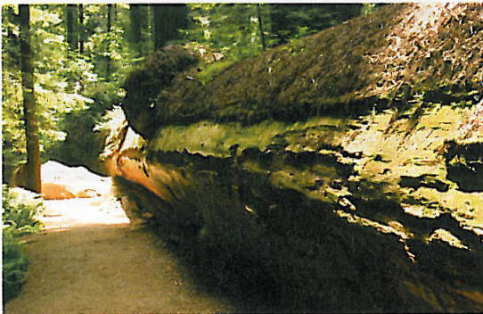
The Dyerville Giant fell in 1991. Prone it is two-stories tall.

As a species it is estimated that the redwoods have been on earth for more than 100-million years.