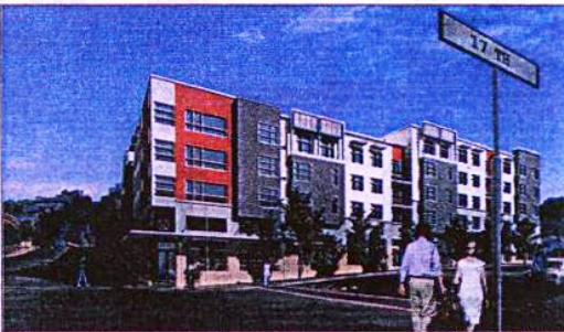
MODEL HOME | The Potrero, San Francisco