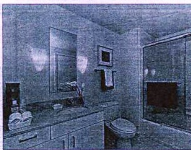
Interior view of a bathroom in the model home.

Another convenient design feature is that the bedroom also can