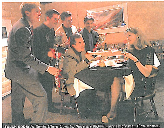
TOUGH ODDS: In Santa Clara County, there are 68,000 more single men than women

tidbits as: "The first gatekeeper to sexual attraction is the way you look."