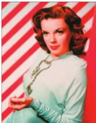
Photo courtesy of George Eastman House A 1945 portrait of Judy Garland by Nickolas Muray.

ble archive means the possibility of greater licensing revenue. Photographs from the archive are available for commercial use at prices ranging from $260 for a onetime editorial use to $600 for use on a cover, calendar or postcard. Other pricing is for non-profit use or for research publication.