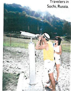
Travelers in Sochi, Russia.

hotels.com; doubles, $95-$125). Culture vultures head to Chettinad, in Tamil Nadu, where mansions are being converted into boutique hotels— Visalam is a favorite (91-484-301-1711; cgheart.com; doubles, $117). And by 2020, 20 million Indians are expected to go overseas to places like New York and the Pyramids. China Hainan Island is finally living up to the Hawaii hype, with Banyan Tree Sanya , its latest high-end resort (86-898-8860-9988; banyantree.com; doubles, $100). The new-money set are discovering cruising, particularly around Malaysia and Brunei, as liners like Silversea expand Far Eastern trips (silversea.com; nine-night cruises from $5,311 per person). And country pads are now de rigueur for the super-wealthy: 100 international architects are designing villas and public buildings in the city of Ordos, Inner Mongolia.